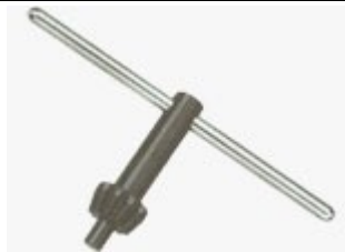
Style 1- T Handle