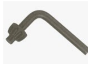
Style 2- L Handle