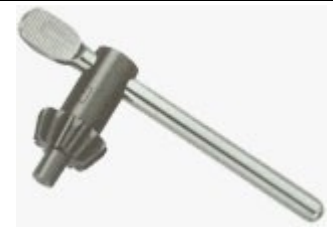
Style 3- Thumb Handle