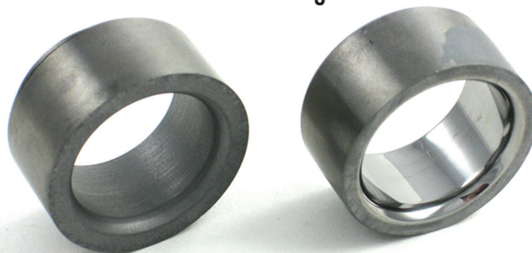
Before Diamond Flex-Hone