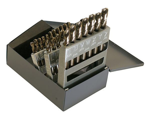
26-piece Straw Finish Letter Size Set