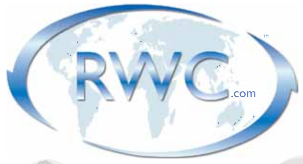
Reliance Worldwide Corporation

Cash Acme and SharkBite® products are manufactured and distributed by the Reliance Worldwide Corporation.