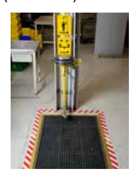
Keep clear – safety (red/white)