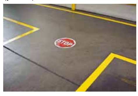
Aisleways & traffic lanes (yellow)